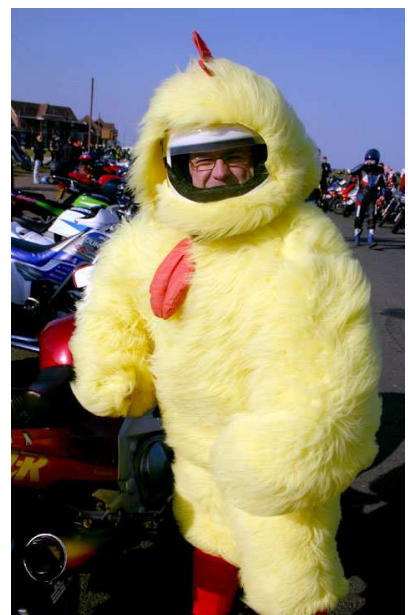
Is this our Treasurer in his true vocation.